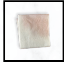
NEGATIVE TEST RESULT

Product Bag Dimensions: 7" x 9" Product 10ct Bag Weight: 47 grams