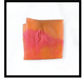
POSITIVE TEST RESULT