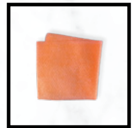
NEGATIVE TEST RESULT