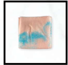
POSITIVE TEST RESULT