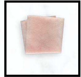
NEGATIVE TEST RESULT